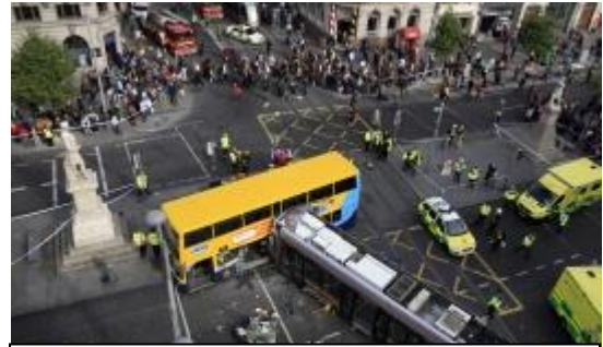
Emergency service personnel attend the scene of a bus and tram collision in Dublin, Ireland, Sept. 16, 2009.

Russia and the US launch global initiative to help stop a lethal epidemic: distracted driving.